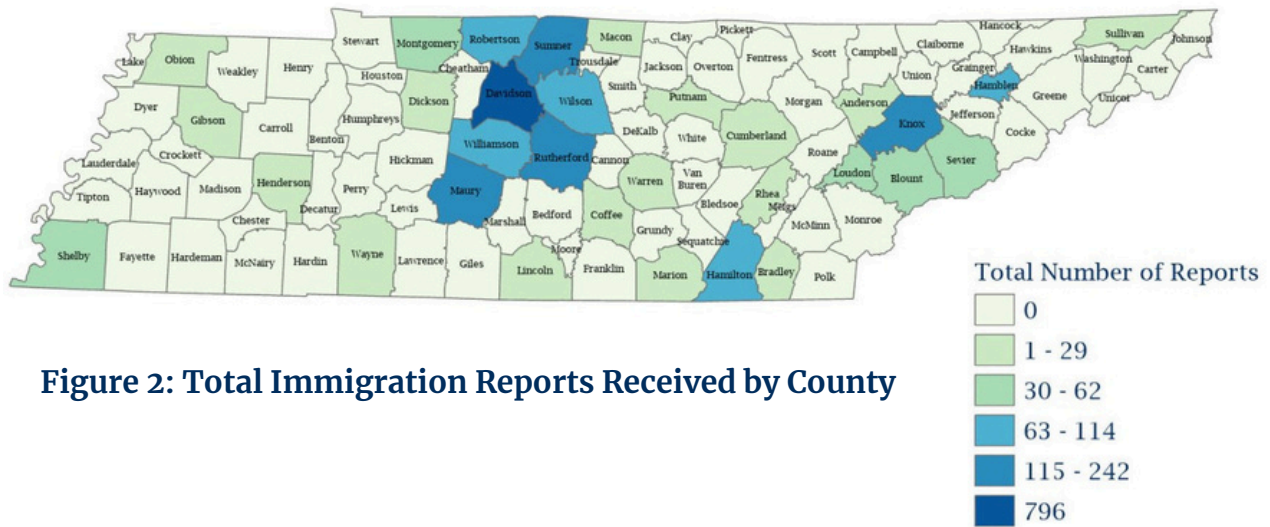
Figure 2: Total Immigration Reports Received by County